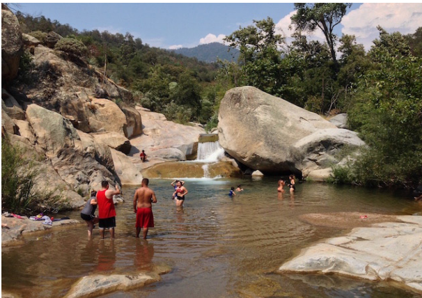
Recreating on Middle Fork Tule River, Sequoia National Forest

Now that the objection meetings are completed, the Forest Service will complete a transcript, review the arguments, and ultimately decide if their final plans require any changes. The agency indicated that this process will occur in early 2023. Stay tuned! ~