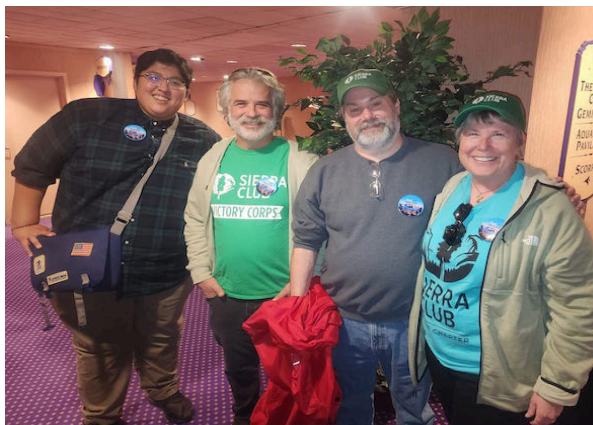
Sierra Club volunteers showed up to support Avi Kwa Ame

The hearing room was overwhelmed by supporters -- with more than 200 attendees packing the meeting room reserved by the Bureau of Land Management for only 150 people. The Honor Avi Kwa Ame Coalition had spent the weekend and week leading up to the hearing making a multitude of calls, sending thousands of text messages, and sending out volumes of emails to turn people out to the hearing. Our Wild America, Sierra Club Toiyabe Chapter, and Southern Nevada Group Volunteers made several hundred phone calls to supporters on our lists to all surrounding communities including Needles, Lake Havasu City, and